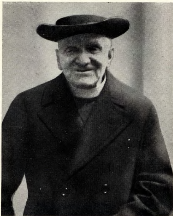
The last years