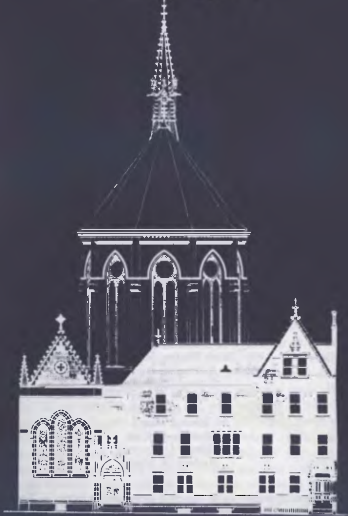
Rear Elevation Church of St. Mary the Virgin New York City.