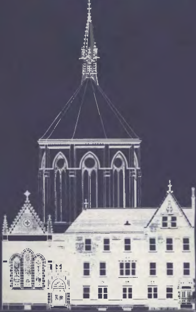
Rear Elevation Church of St. Mary the Virgin New York City.