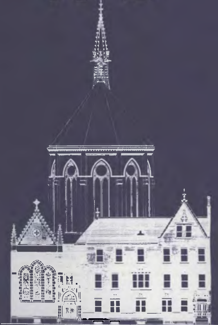
Rear Elevation Church of St. Mary the Virgin New York City.