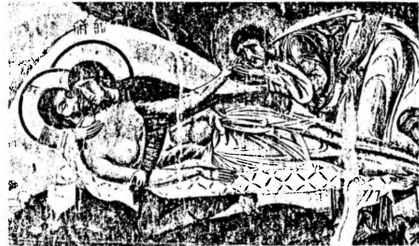
The Deposition and the Lamentation. Wall painting. c. 1164. Nerezi, St. Pantaleimon

Messe Solennelle (Saint-Cecile) Charles Francios Gounod (1818-1893)