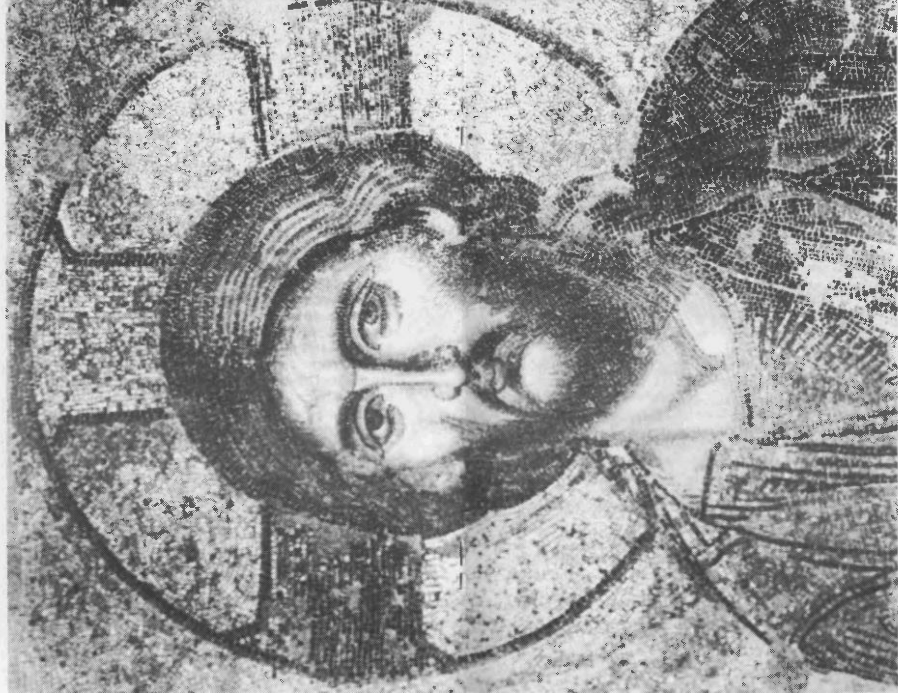
Christ. Detail from the mosaic panel of the Deesis in the south gallery. Late thirteenth century. Istanbul, Hagia Sophia